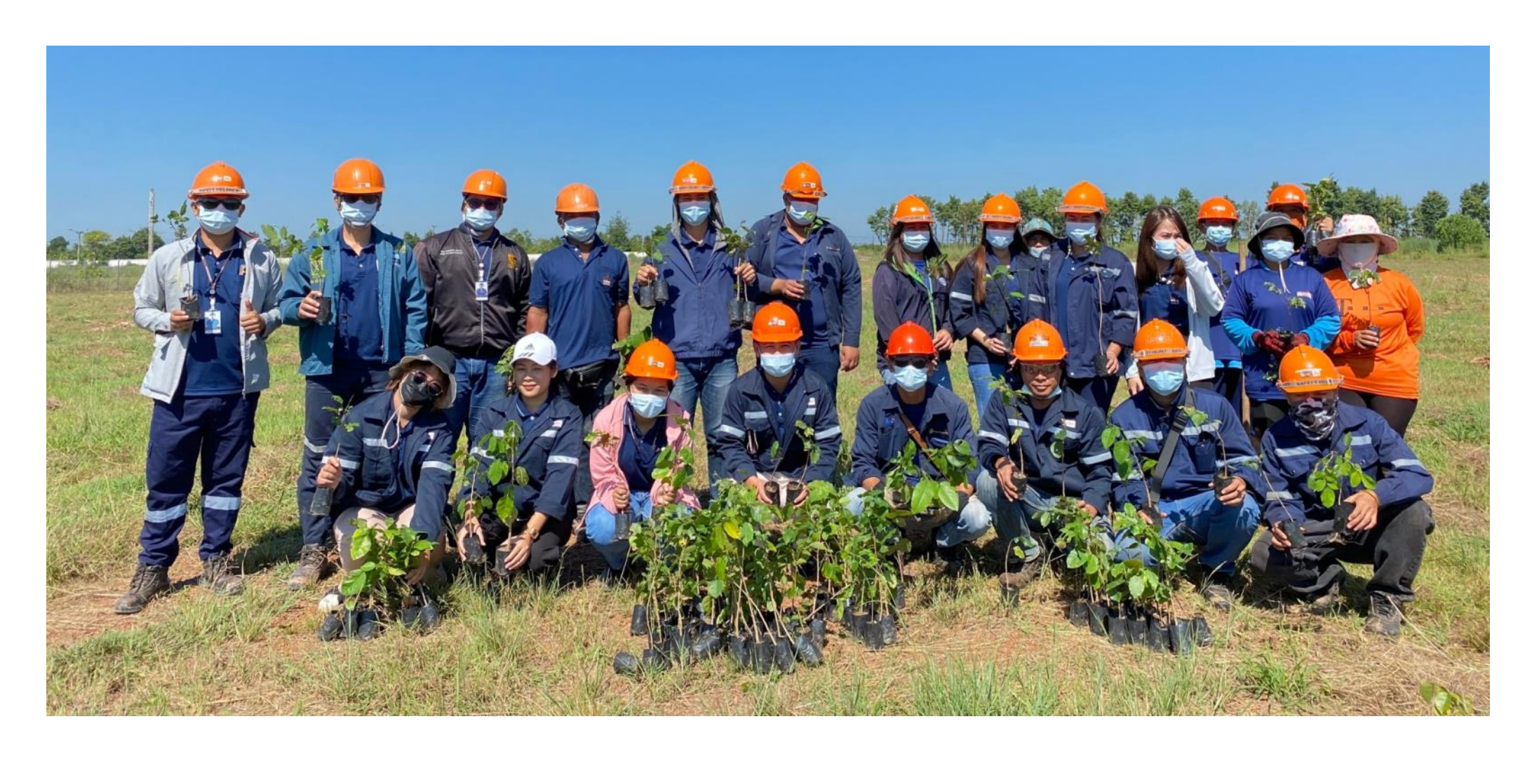
Tree Planting Activity

Aim to enhance surrounding environment, absorbing carbon dioxide and providing food source for the local community. Further, locals can have better living by selling natural resources.