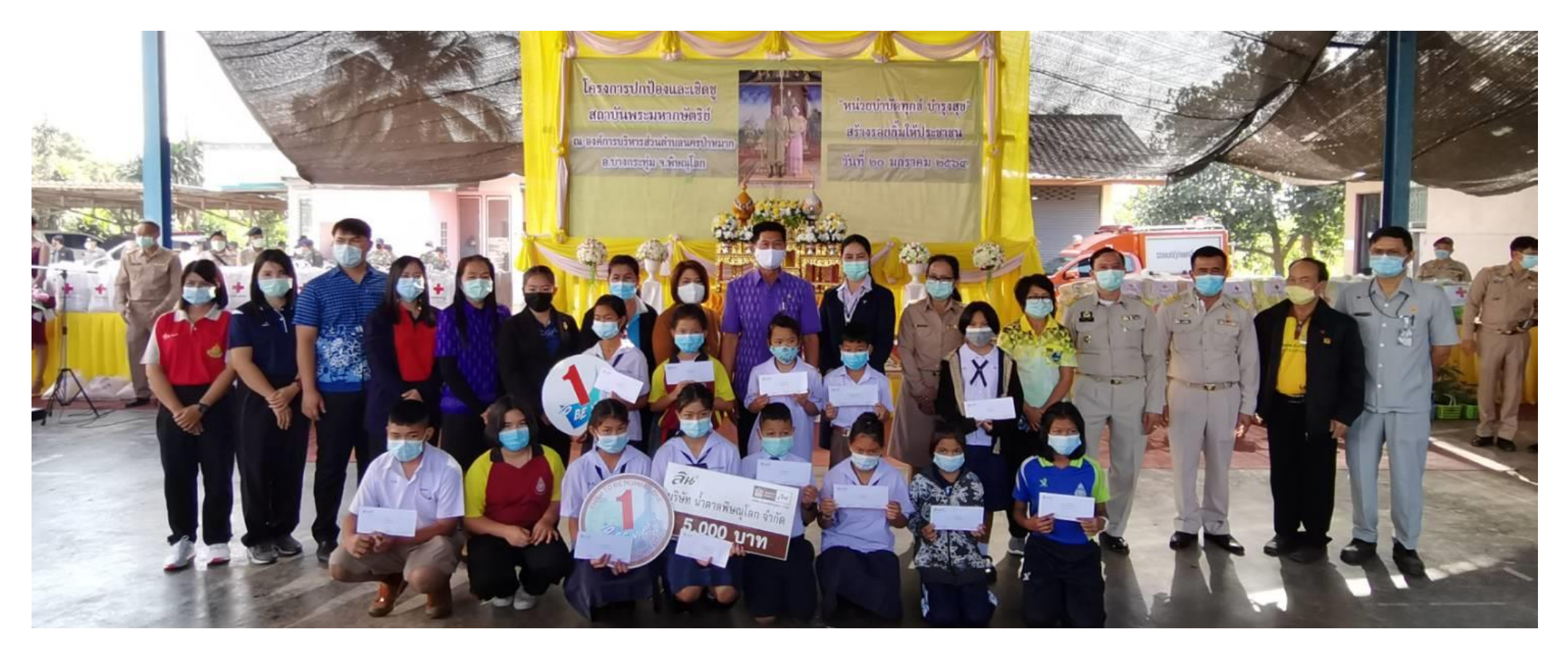
Baanrai Sugar Industry factory organized children's day activities at the factory's staff house.