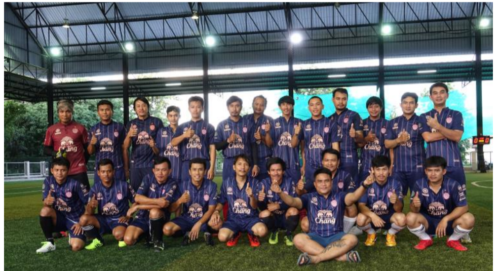
Thai Roong Ruang Industry factory (Phetchabun)

Thai Roong Ruang Sugar Group organized sport day annually to promote good health and to build teamwork and enhance relationships between factories.