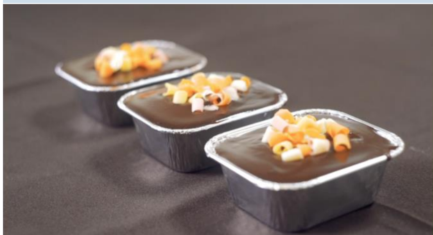
Yogurt Cake With Chocolate