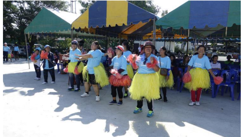
Thai Roong Ruang Industry factory (Phetchabun)