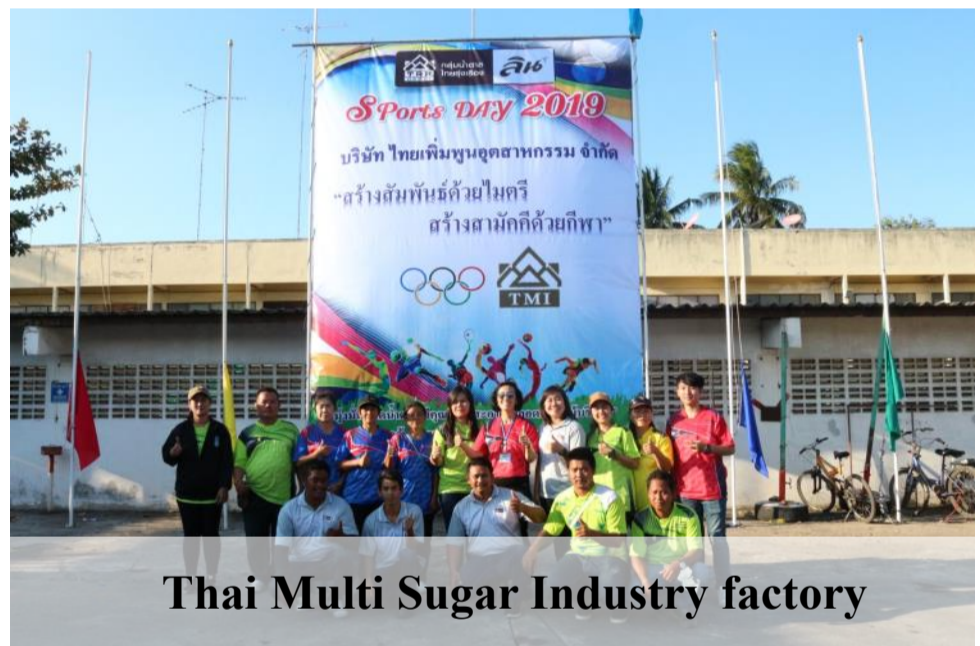
Thai Multi Sugar Industry factory