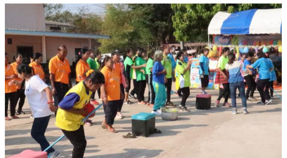
Thai Roong Ruang Industry factory (Sakon Nakhon)