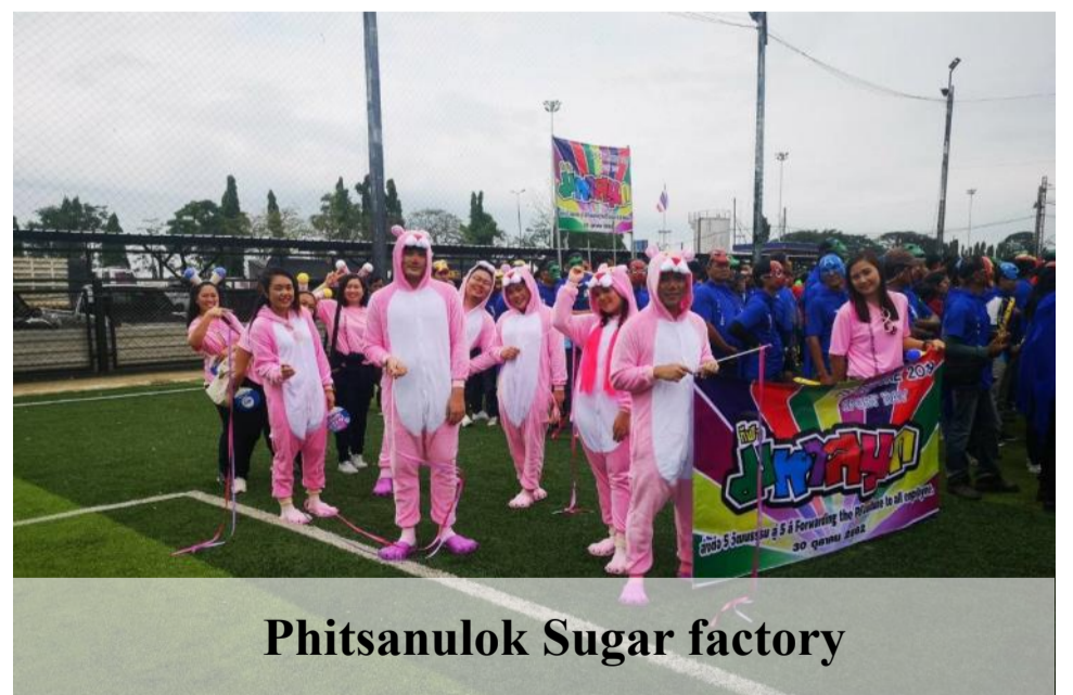
Phitsanulok Sugar factory