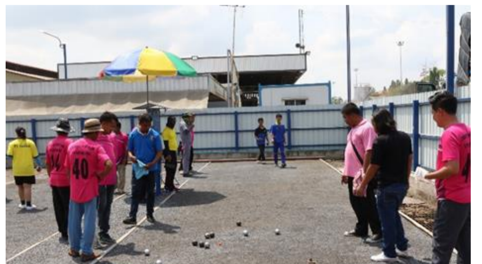
Phitsanulok Sugar factory