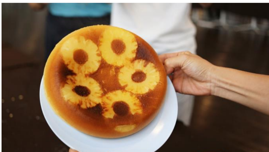
Pineapple Lemon Upside Down Cake